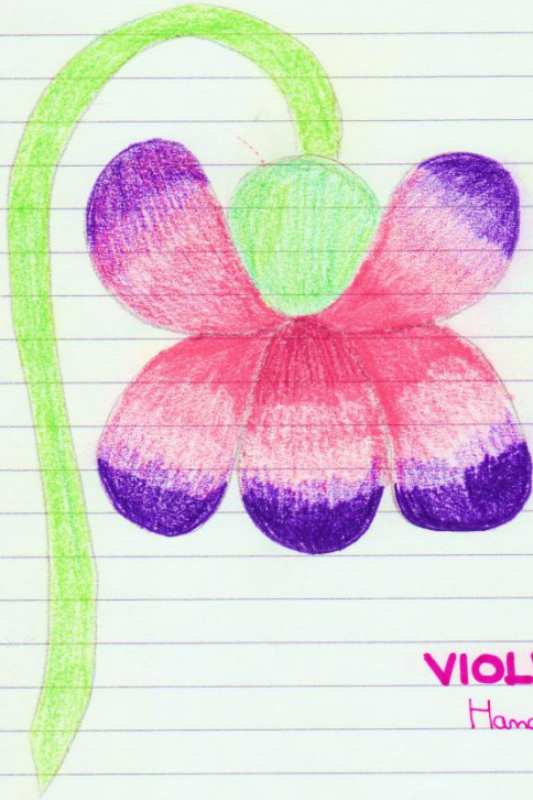
VIOLET Hama Stimisă