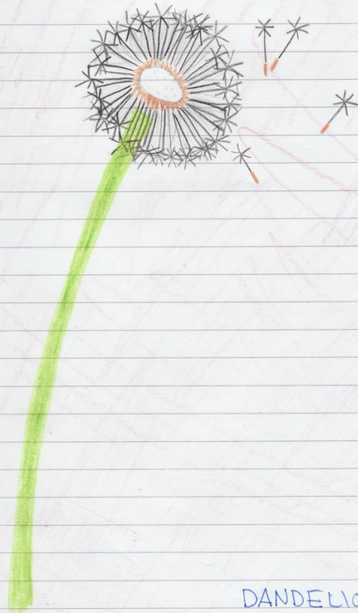
DANDELION Neža Vode, 7.a